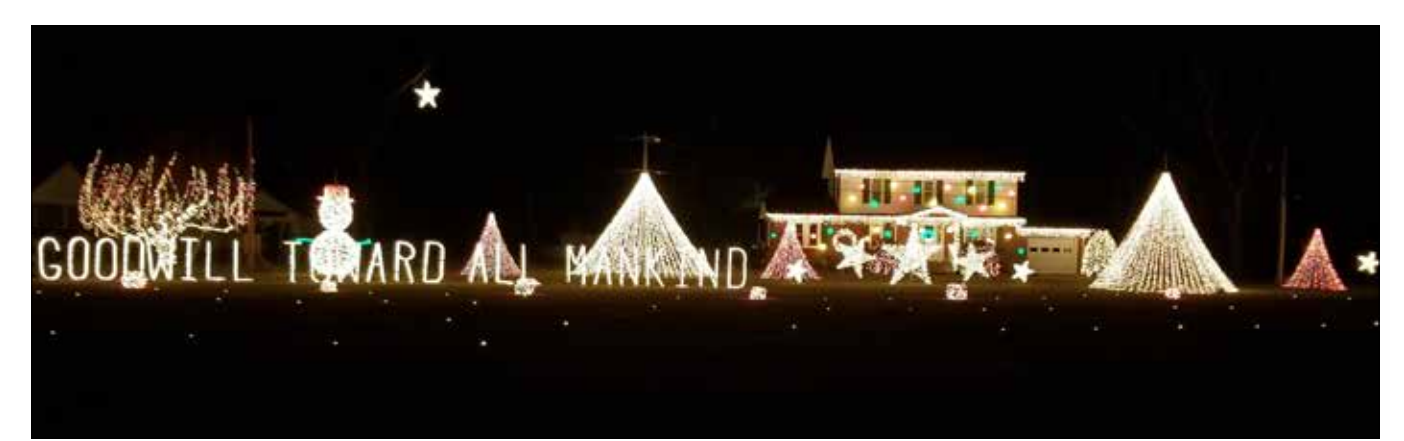
CAROLINA COUNTRY • TIDELAND TOPICS • DECEMBER 2020 • C

Remember to support these importance system maintenance operations. Proper tree care leads to greater system reliability.