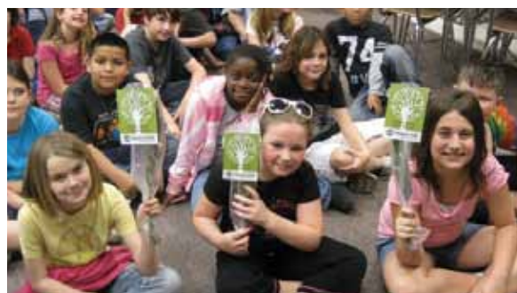
Future foresters at Bridgeton Elementary.