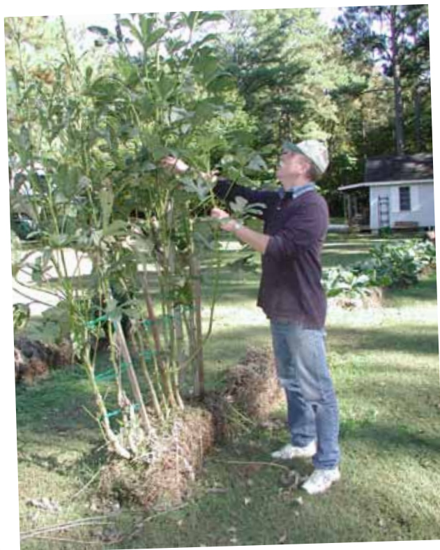
Plan on using a trellis of some kind for tall stalks like this okra.

For additional info and a lot more photos, please visit my online bale gardening thread at: www.4042.com/4042forums/showthread.php?t=12405