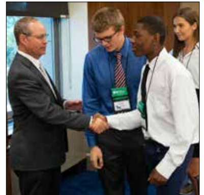
Meeting Congressman Greg Murphy