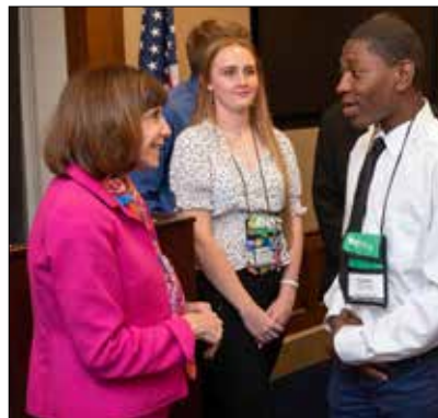
Meeting Congresswoman Kathy Manning