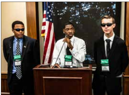
First official press conference?