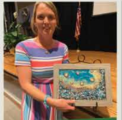
KELLY ROUSE • BELHAVEN FRAMED MIXED MEDIA ART