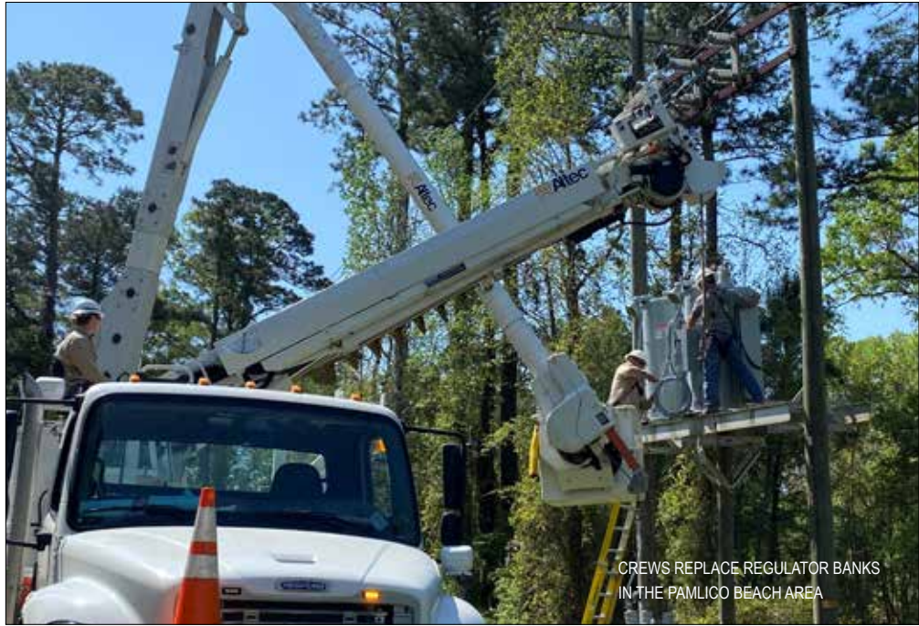
CREWS REPLACE REGULATOR BANKS IN THE PAMLICO BEACH AREA