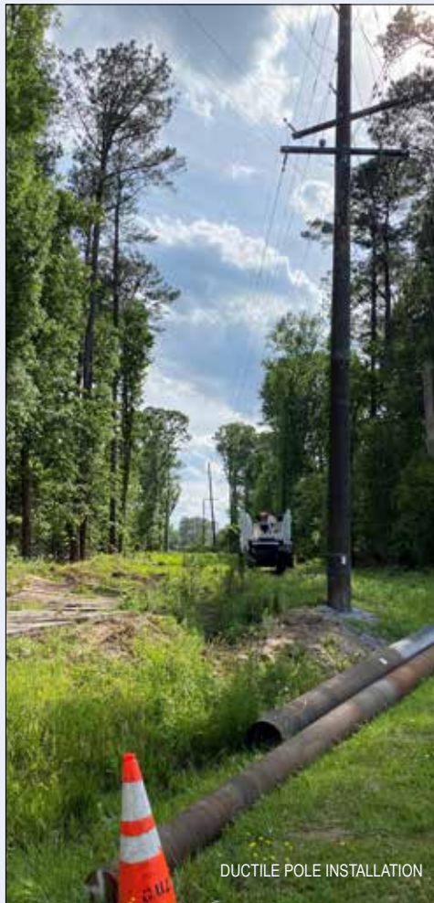
DUCTILE POLE INSTALLATION