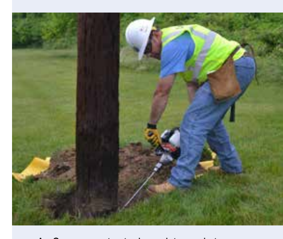
An Osmose contractor bores into a pole to inspect for internal signs of decay.

Osmose continues pole inspection work for the cooperative. During August they will be in Grantsboro, Bayboro and Fairfield Harbour.