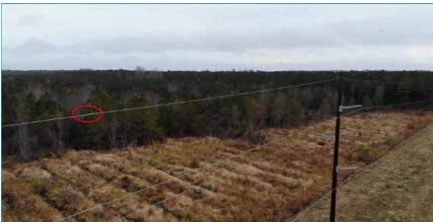
A drone was used to help identify the damage to the 115kV transmission line.