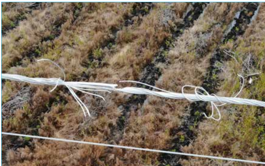
A close up shot of the damaged section of line reveals the bullet hole.

On Friday, January 3, the co-op conducted a planned outage lasting two hours to splice in anew fiber optic span. The cost of materials was $33,000 and the fee for the fiber optic splice team was $5,000. Over 2,600 members were impacted by the repair outage.