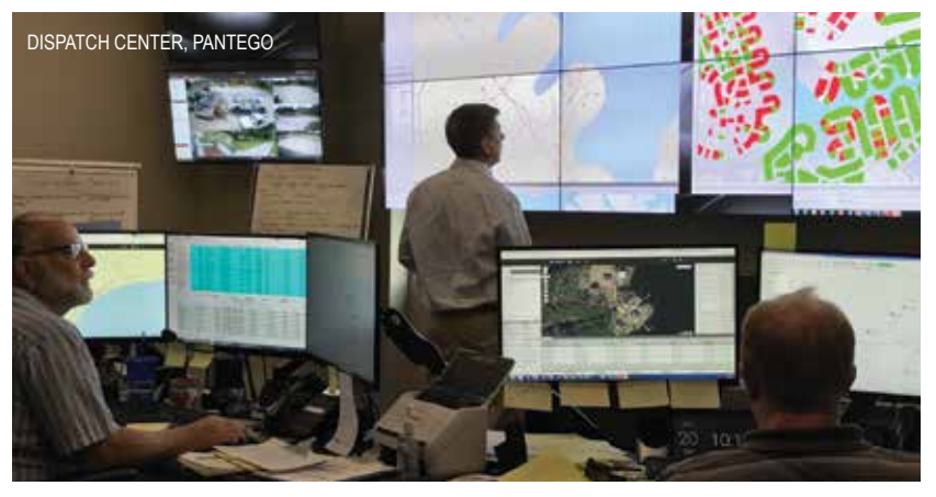
Technology and teamwork Continued from previous page

RESTORATION WORK IS COMPLETE. RECOVERY WORK BEGINS TO RECONNECT LOCATIONS DEEMED UNSERVICEABLE PENDING OWNER REPAIRS AND RECEIPT OF ELECTRICAL INSPECTION PERMITS