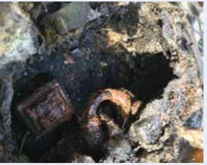
The charred remains of an electric meter that went underwater at Fairfield Harbour while energized