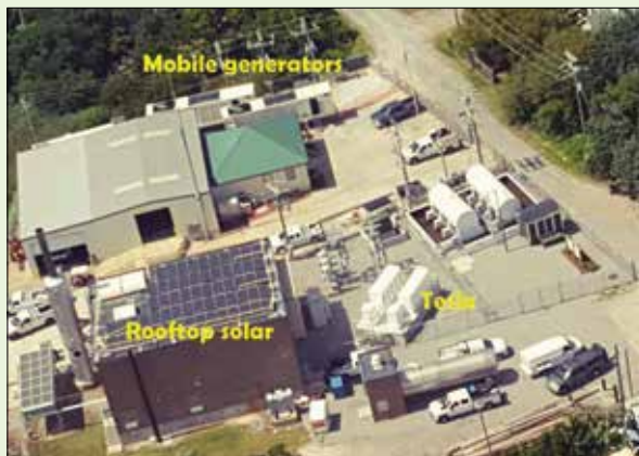
This aerial image was taken during this summer's transmission outage while mobile generators were powering the island.

and is routinely used to provide peaking power on the hottest summer days when the island is hosting thousands of vacationers. The generator is owned by the NC Electric Membership Corporation (NCEMC), the power supplier