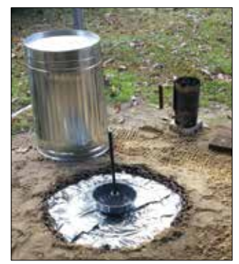
Create a pit out of tinfoil. Bundt pan is for drippings.