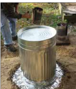
Slide turkey on post and put trashcan on top.