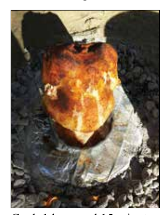
Cook 1 hour and 15 minutes for every 10 lbs. of turkey