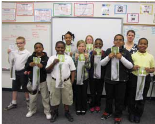
Fourth graders at Aurora's Snowden Elementary School proudly display their loblolly pine seedlings

Trees are also the No. 1 cause of power outages. Tideland EMC spends well over $1 million annually to trim and when necessary remove trees that encroach on the utility right-of-way. The co-op hopes that by instructing children early on about the importance of maintaining proper utility clearances they will in turn help us minimize those maintenance costs in the future.